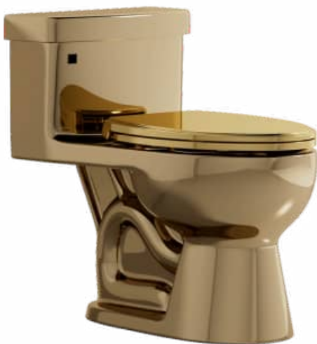
One-Piece Toilet (Pre-installed Toilet Tank Components)