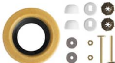
Wax Ring & Bolt Kit