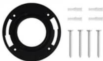
Flange & Bolt Kit