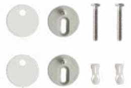
Seat Bolt Kit