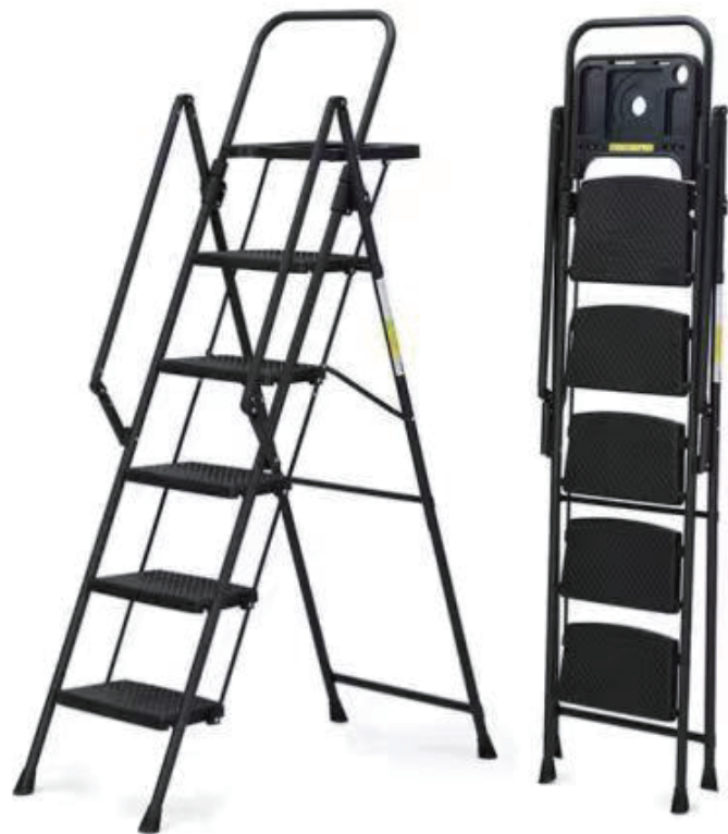
Household Steel Ladder Series