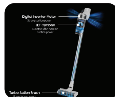
Advanced Cleaning Performance (150 Air Watts)