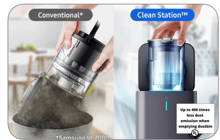
Anti-Dust Emitting Structure