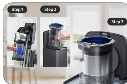
Auto Empty Dust Bin