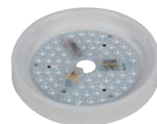
⑦ Light source