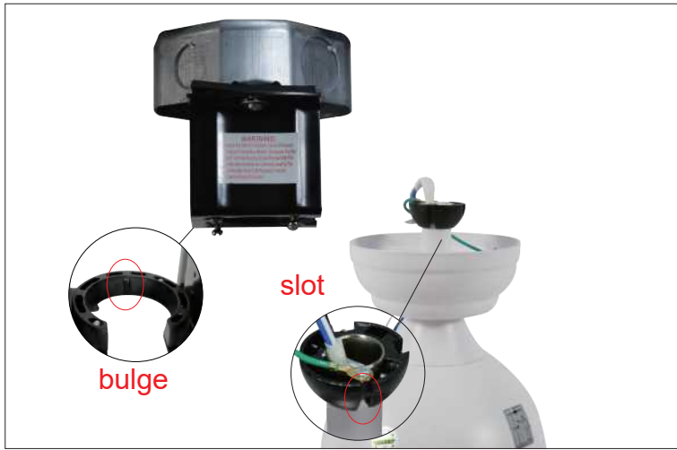
Step 9 Hang the fan on the hanging bracket and align the slot on the downrod with the bulge on the hanging bracket.