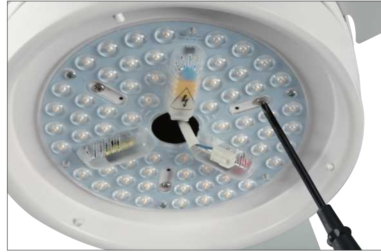
Step 14 Fix the light kit with the screws.