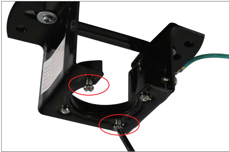
Step 8 Loosen the two opposite screws