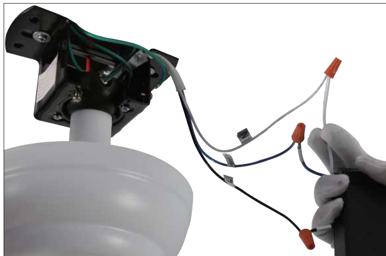
Step 10 Connect the same color wires of the fan and receiver.