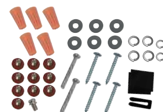
⑨ Hardware fitting