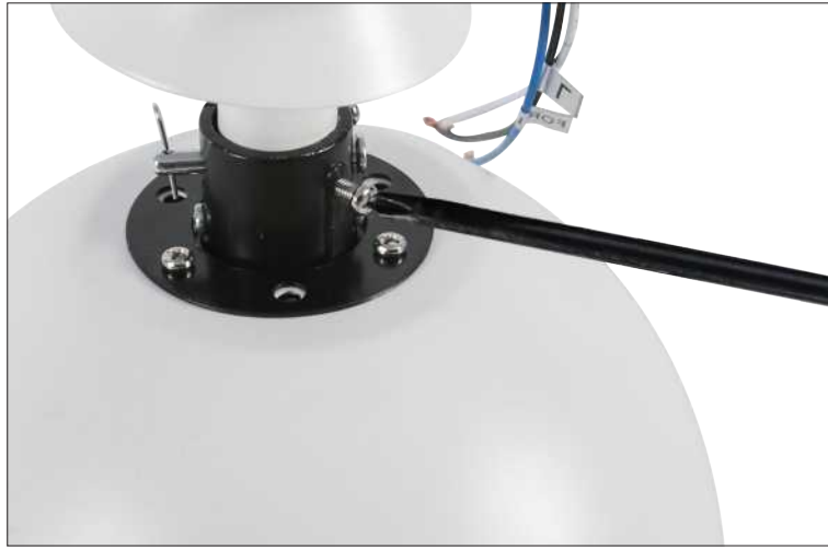
Step 6 Tighten the 2 screws of the coupler.