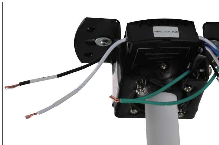
Step 11 Connect the receiver to home wires. Black for Live wire, White for neutral wire, Green for ground wire.