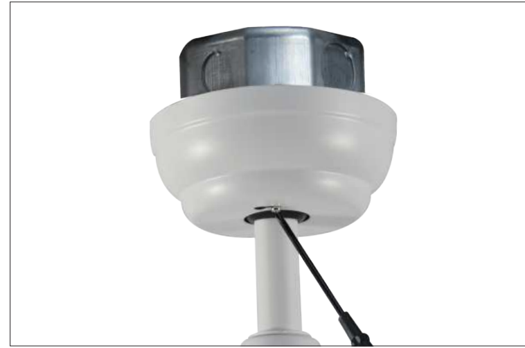
Step 12 Rotate the up canopy and tighten the screws.