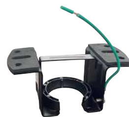
② Hanging Bracket