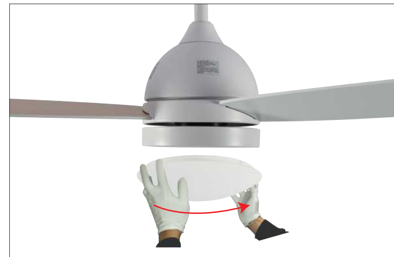
Step 16 Rotate the light cover until fixed.