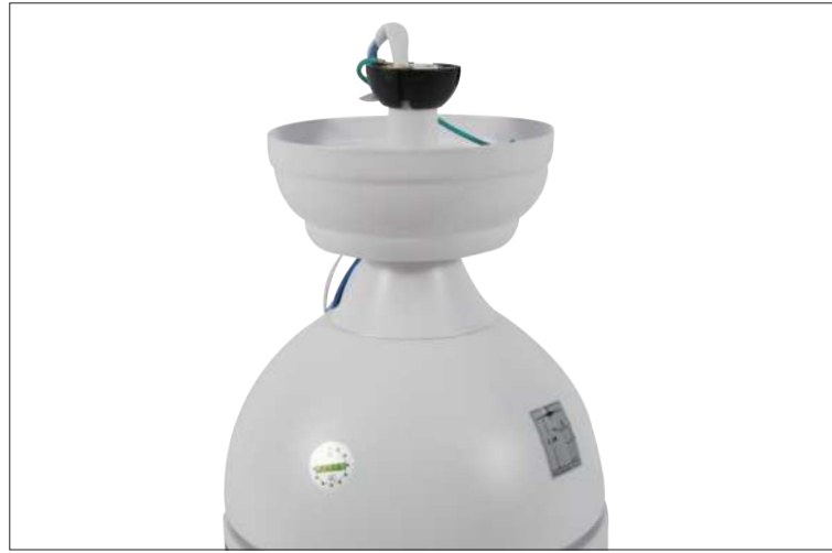
Step 7 Cover the coupler with down canopy.