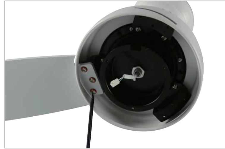
Step 13 Install the blades, tighten the screws.