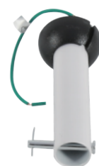
⑤ Down Rod