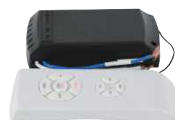
⑩ Remote Control