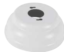
③ Up Canopy