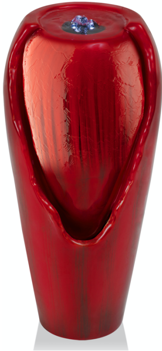
Fountain (LED light pre-installed) 1x