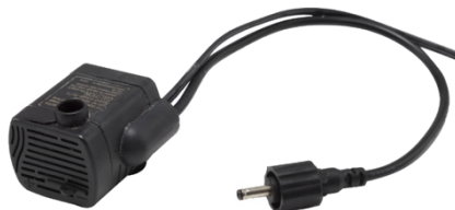
Pump (with light cord) 1x