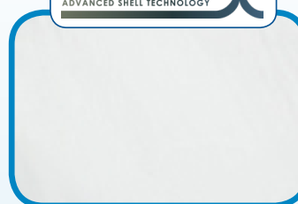
Glacier White Shell