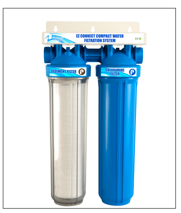
Front of Pelican EZ Connect PC-200

If this or any other system is installed in a metal (conductive) plumbing system, i.e. copper or galvanized metal, the plastic components of the system will interrupt the continuity of the plumbing system. As a result any errant electricity from improperly grounded appliances downstream or potential galvanic activity in the plumbing system can no longer ground through contiguous metal plumbing. Some homes may have been built in accordance with building codes, which actually encouraged the grounding of electrical appliances through the plumbing system. Consequently, the installation of a bypass consisting of the same material as the existing plumbing, or a grounded "jumper wire" bridging the equipment and reestablishing the contiguous conductive nature of the plumbing system must be installed prior to your systems use.