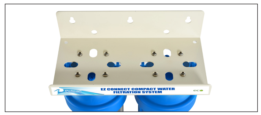
Top of Pelican EZ Connect PC-200