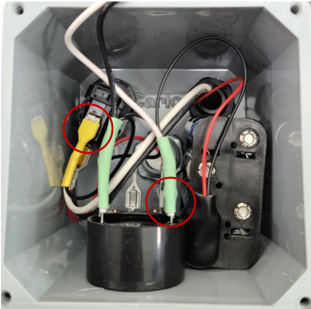
Figure 4: Alarm Interior (P & HW Version)