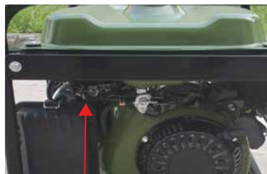
Choke (Figure B)