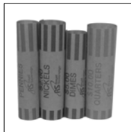
Coin Wrapper Starter Pack