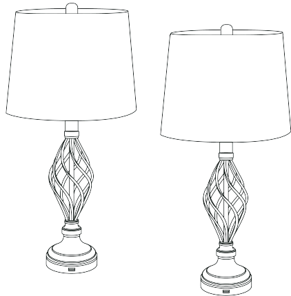
Table Lamp Set of 2