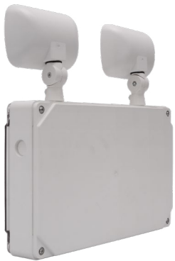
The ECL5 installs with a universal mounting plate with EZ quick connect, for a quick and easy installation.