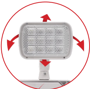
120° TILT WITH 360° ROTATION