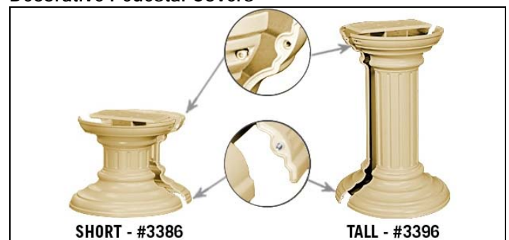
SHORT - #3386