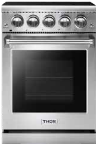
Product: 24 Inch Professional Electric Range in Stainless Steel Model Number: HRE2401