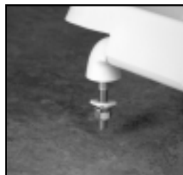
EXTERNAL CHECK HINGES WITH 300 SERIES STAINLESS STEEL POST