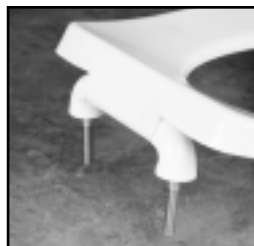
EXTERNAL CHECK HINGE