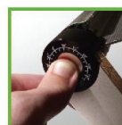
Depress the button to adjust the leg.

The joint is locked when the button is extended. Only use WorkEZ when all joints are locked.