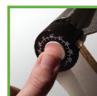
An extended button means the joint is locked.