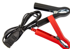
ITEM# 54790 Frontline™ Quick Connect Clamps