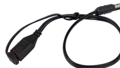
ITEM# 54794 Frontline™ SAE Quick Connect Adapter