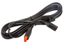
ITEM# 54792 Frontline™ Extension Cable