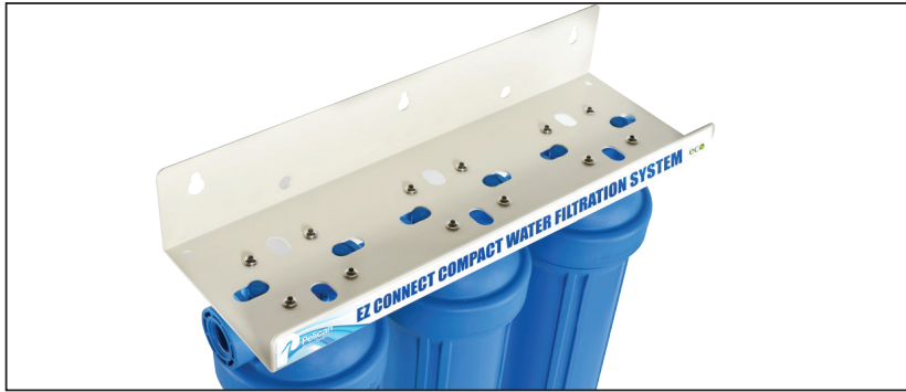
Top of Pelican EZ Connect PSE-500