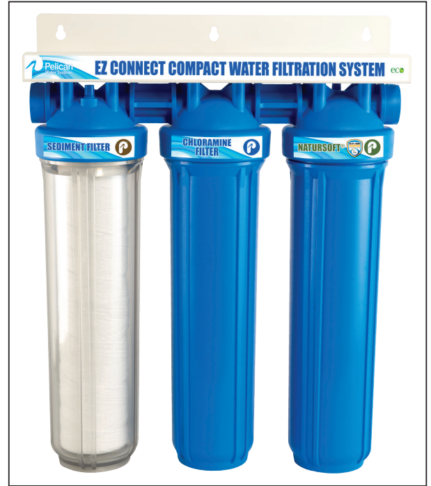
Front of Pelican EZ Connect PSE-500

If this or any other system is installed in a metal (conductive) plumbing system, i.e. copper or galvanized metal, the plastic components of the system will interrupt the continuity of the plumbing system. As a result any errant electricity from improperly grounded appliances downstream or potential galvanic activity in the plumbing system can no longer ground through contiguous metal plumbing. Some homes may have been built in accordance with building codes, which actually encouraged the grounding of electrical appliances through the plumbing system. Consequently, the installation of a bypass consisting of the same material as the existing plumbing, or a grounded "jumper wire" bridging the equipment and reestablishing the contiguous conductive nature of the plumbing system must be installed prior to your systems use.