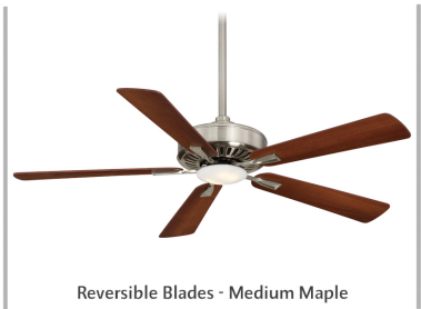
Reversible Blades - Medium Maple