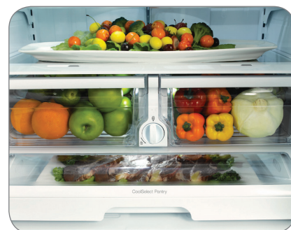
CoolSelect Pantry™ with Temperature Control