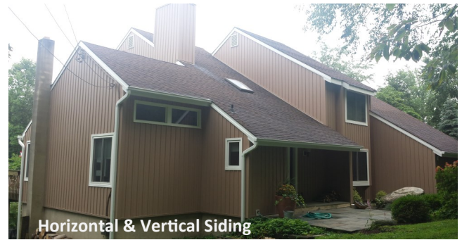
Horizontal & Vertical Siding

Designed For Use With Fullback ® V, Flat Insulation or No Insulation, The Choice Is Yours!