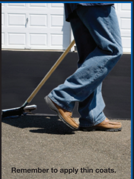
Remember to apply thin coats.

Using a squeegee spread sealer side to side by pulling squeegee across driveway removing the excess sealer. Apply steady down pressure as two thin coats are better than one thick coat. Allow first coat to dry thoroughly before applying the second coat. Driveway will be foot traffic ready in 1 hour in good drying conditions. For vehicle traffic allow 24-48 hours to allow for proper cure.