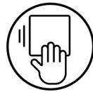
RUB LIGHTLY WITH SOFT CLOTH