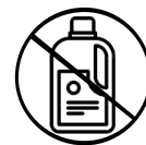
BLEACH STAYS ON TOO LONG