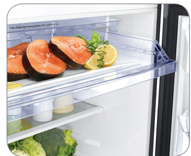
Slide & Reach Pantry