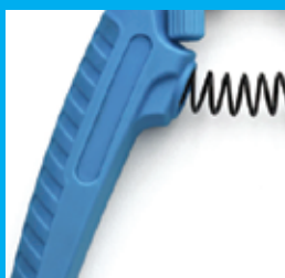
SOLVENT RESISTANT RUBBER ANTI-SLIP GRIP