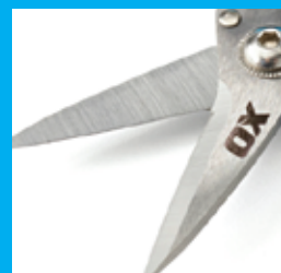
SERRATED EDGED BLADE