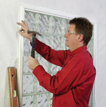
Real Glass Block Window for New Construction includes Nail Flange and J-Channel