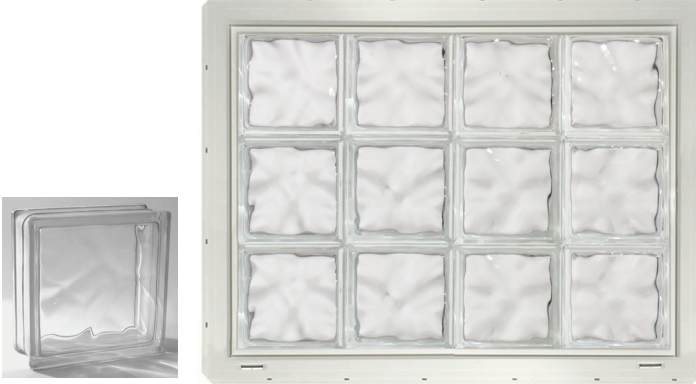
WAVY (DC) Maximum light with moderate distortion.