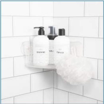
Suction Cup Caddy

Suction Cup Shower Caddies give you a little extra storage where you need it, without the bulkiness of a full-size caddy. The plastic basket design is versatile and multifunctional to easily store lightweight personal care items.