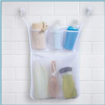
Mesh Organizational Caddies

Suction Cup Shower Caddies give you a little extra storage where you need it, without the bulkiness of a full-size caddy. The plastic basket design is versatile and multifunctional to easily store lightweight personal care items.