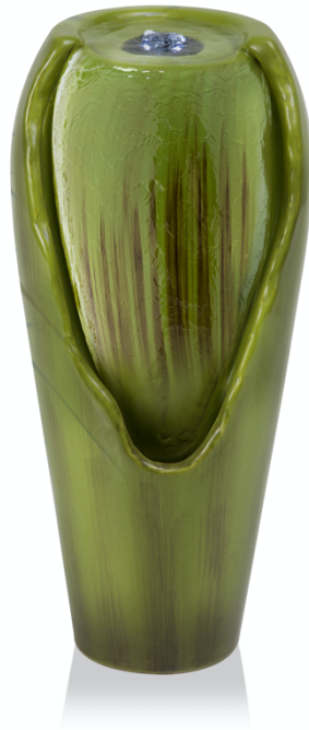
Fountain (LED light pre-installed) 1x