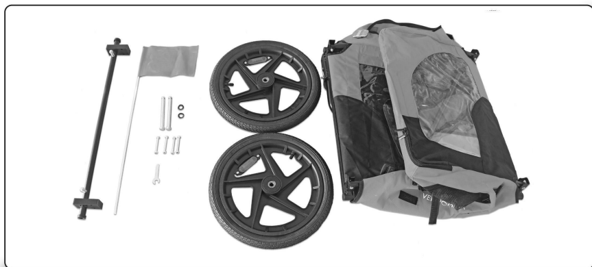
▲ Product Parts Display