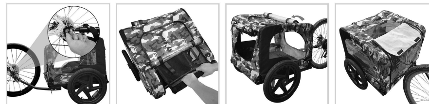
9. Matching bike