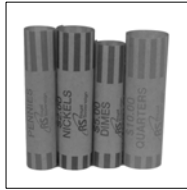
Coin Wrapper Starter Pack