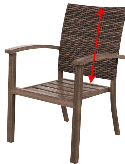
MEASURE HEIGHT OF BACK TOP to BOTTOM