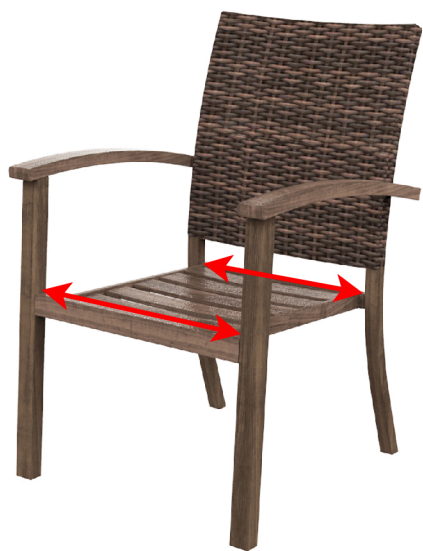
MEASURE WIDTH BETWEEN the ARMS