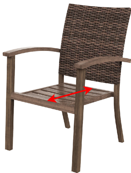
MEASURE DEPTH OF SEAT FRONT to BACK