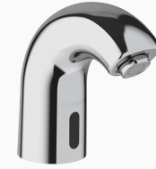
Variation not shown: 4" Trim Plate