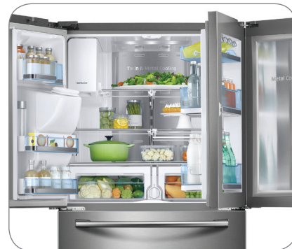
Food ShowCase Fridge Door