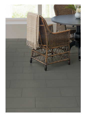
Steel 12 x 24 Unpolished