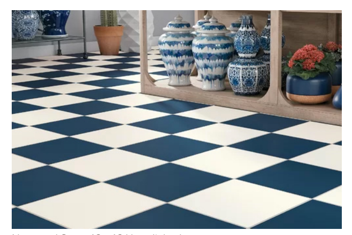
Navy and Snow 12 x 12 Unpolished