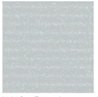
Light Grey Textured