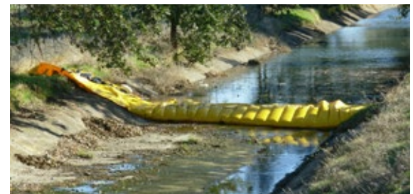
Water-Gate in water application