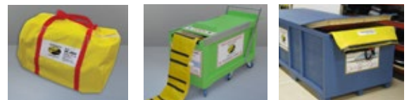
Deployment methods for Water-Gate