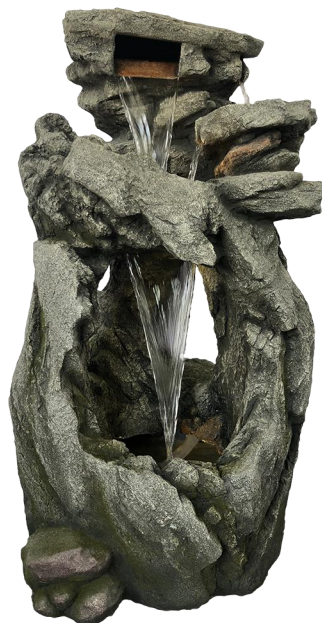
Fountain (LED lights pre-installed)