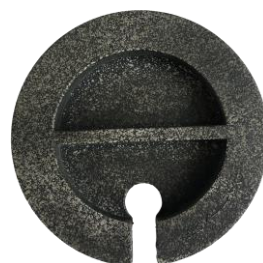
Fountain Back Door