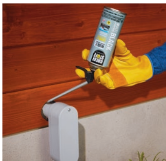
Around Electrical Lines