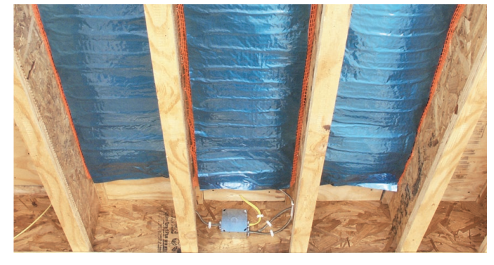
SunTouch UnderFloor - multiple joist bays