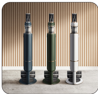
Contemporary and Premium Design