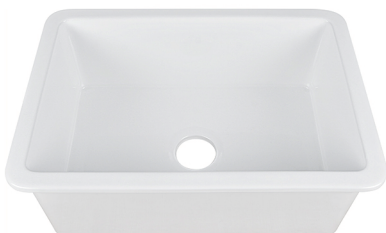
● Fireclay Kitchen Sink(DV-1K509)