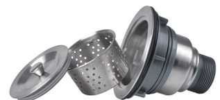
● Basket Strainer(DV-1D905)