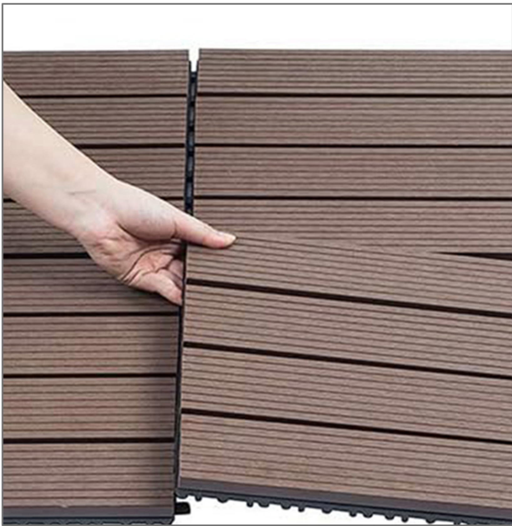
2 Press hard for snapping tight.