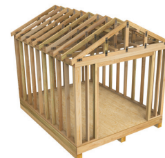
GENERAL CONSTRUCTION PROJECTS