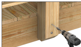
DECK POSTS, BEAMS, HANDRAILS, AND OTHER EXTERIOR PROJECTS