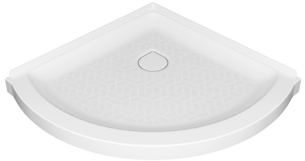
A8016T-CO SHOWER BASE Center Drain