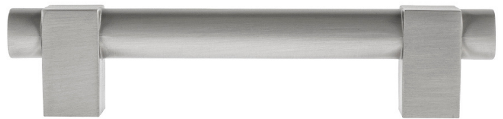
Satin Nickel - RL061756