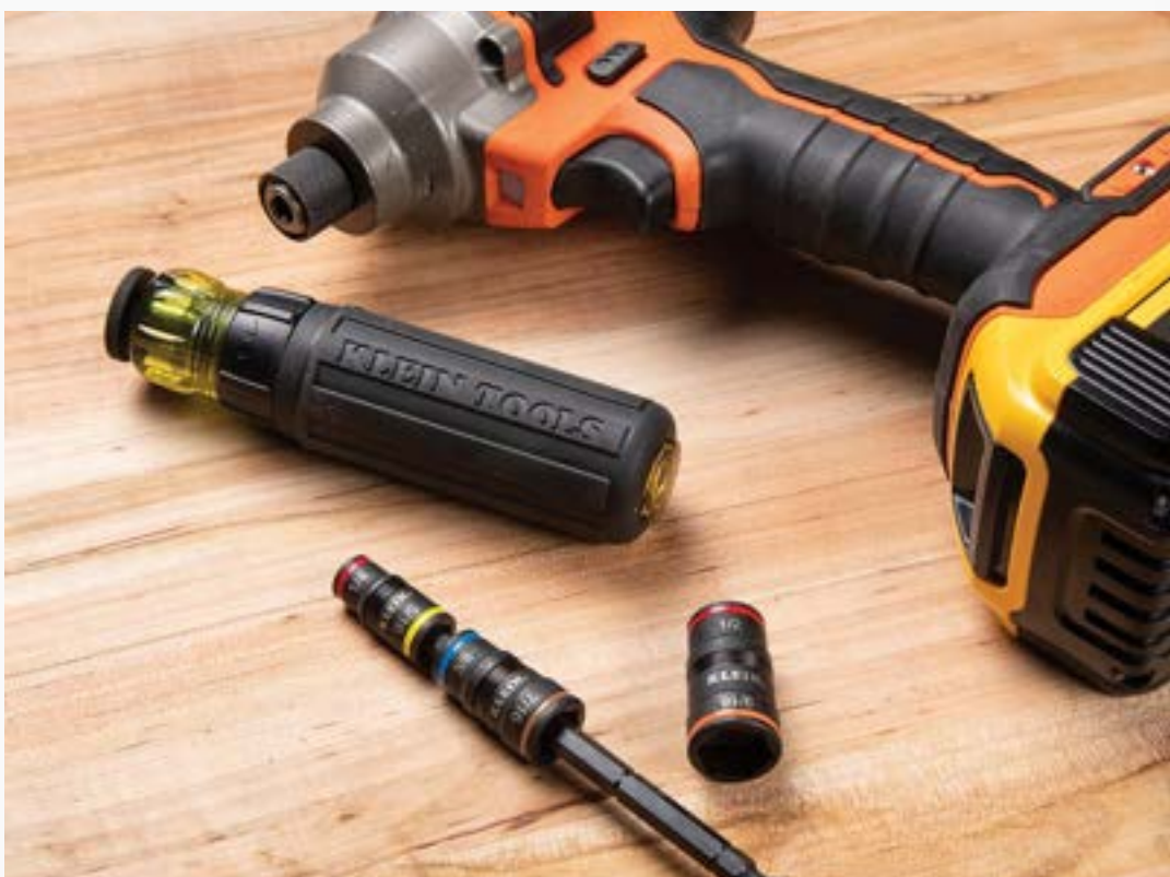
Quick Interchange Blade Switch between screwdriver handle and impact driver