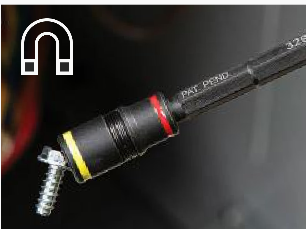
Rare-Earth Magnet Securely hold bits and fasteners