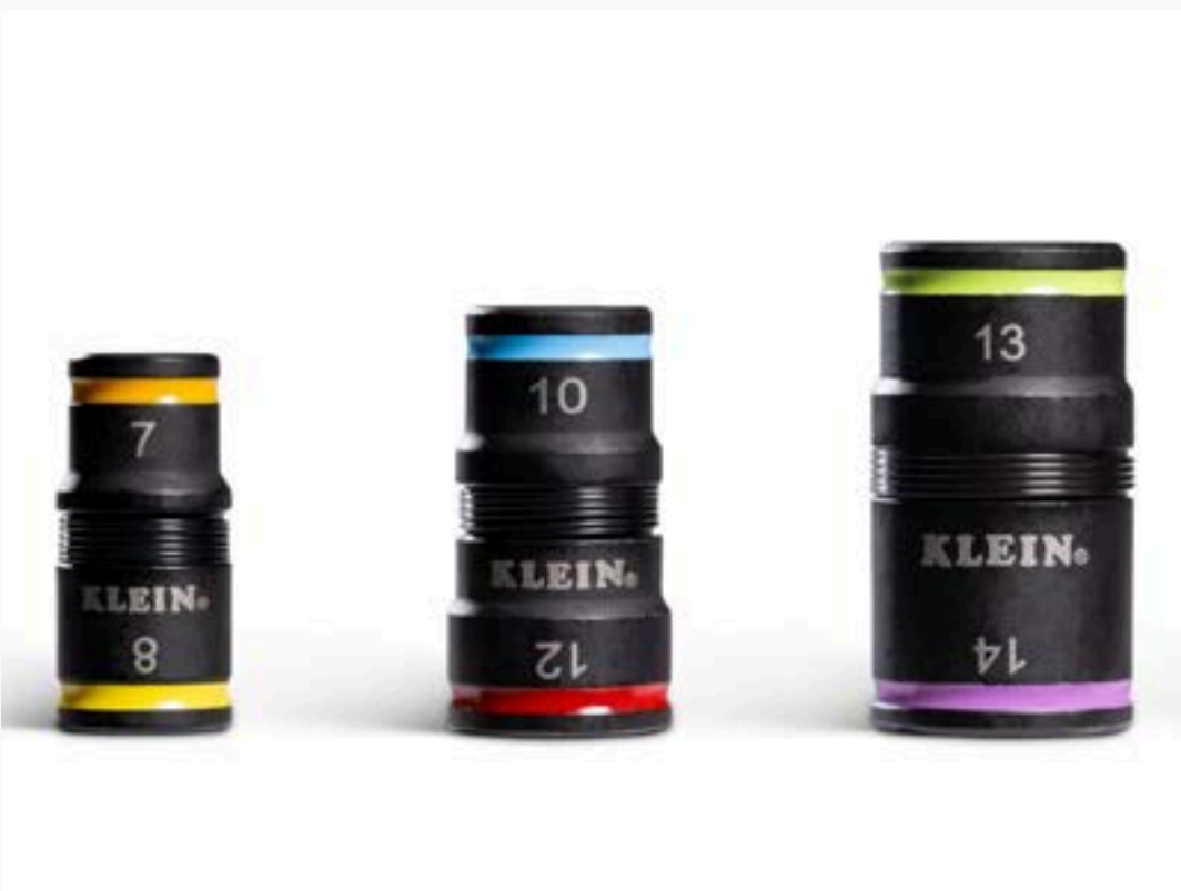
Color-Coded Sockets Easily distinguishable for quick identification