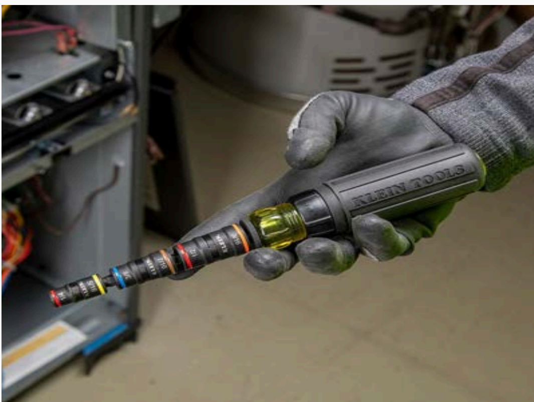
Socket Storage Sockets stored on shaft during use