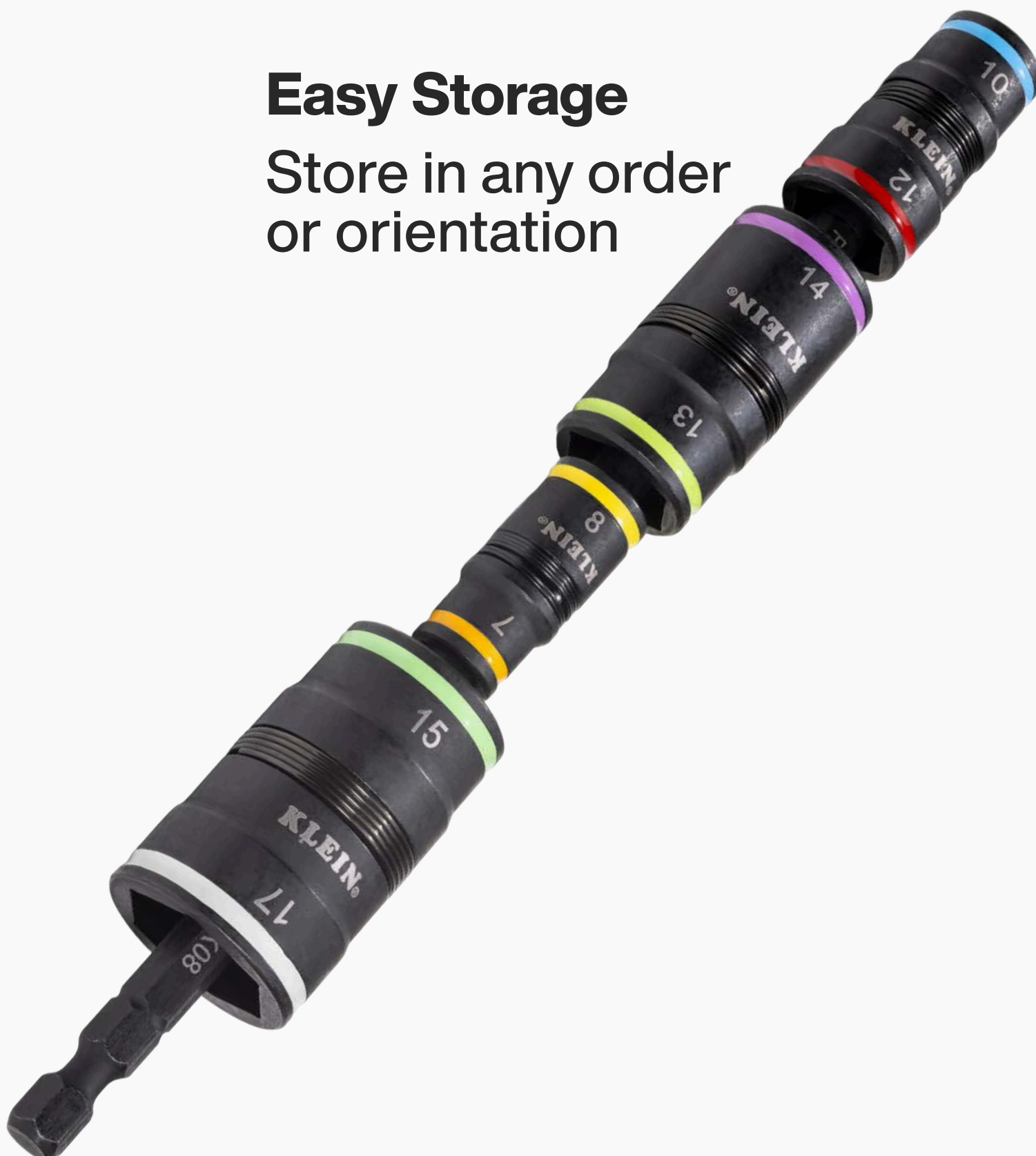
Easy Storage Store in any order or orientation