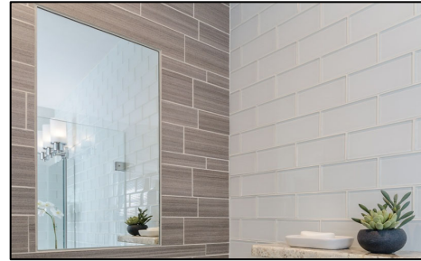
Figure 3. Grout around the mirror to seal and finish.

Caulk or grout around the edges. See Figure 3.