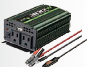
300 Watt Power Inverter