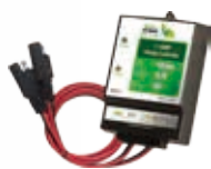
11 Amp Charge Controller