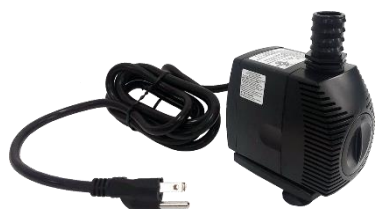
Fountain Pump* x1