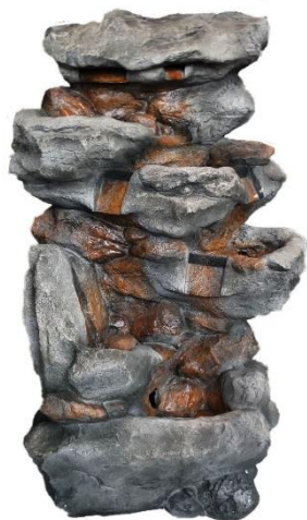
Fountain (5 LED lights pre-installed) x1