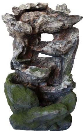
Fountain (4 LED lights pre-installed) 1x