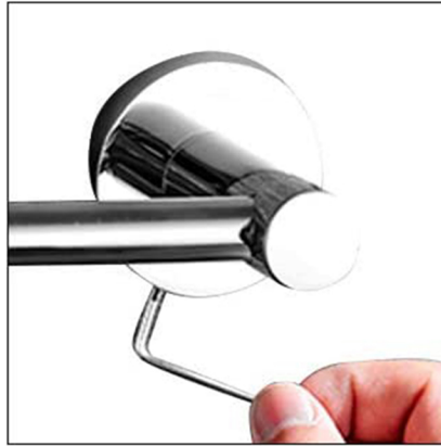
3. Use the L tool to unscrew the plate