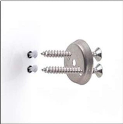
4. Insert the screws into the plate, then install the screws into the anchors on the wall