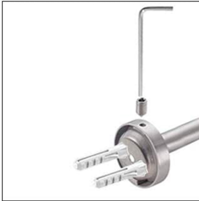
5. Tighten the screws and everything's done