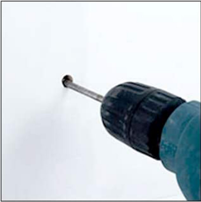
1. Pre-drill - Measure distance and drill holes on wall